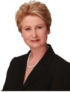
CEO Global Connections Inc.